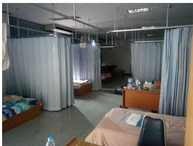
Figure 2: Dormitory

The accommodation is in a big building on the eleventh floor, so you can see the city. In the building are also the sport facilities, it's possible to try every sport which is offered. Bangkok is really a noisy place, but in the surrounding of the university it's relatively silent. Maybe you need some time to adopt, but then you will enjoy this place.