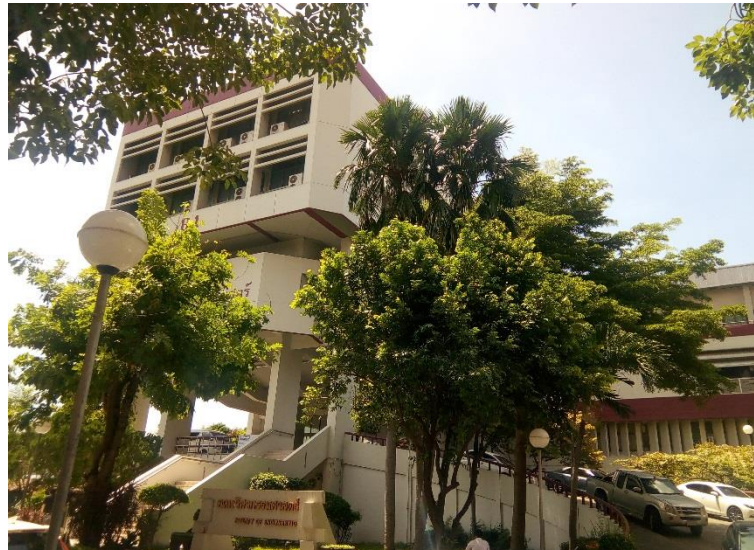
Figure 1: Department of Industrial Engineering

My boss was really kind and took the time to introduce me to everything. He provided me an office with full equipment and connected me with other students and researchers. My main task was research about the inventory routing problem in combination with a genetic algorithm. This topic was new for me and fit to my interests. It was an honor for me to study,